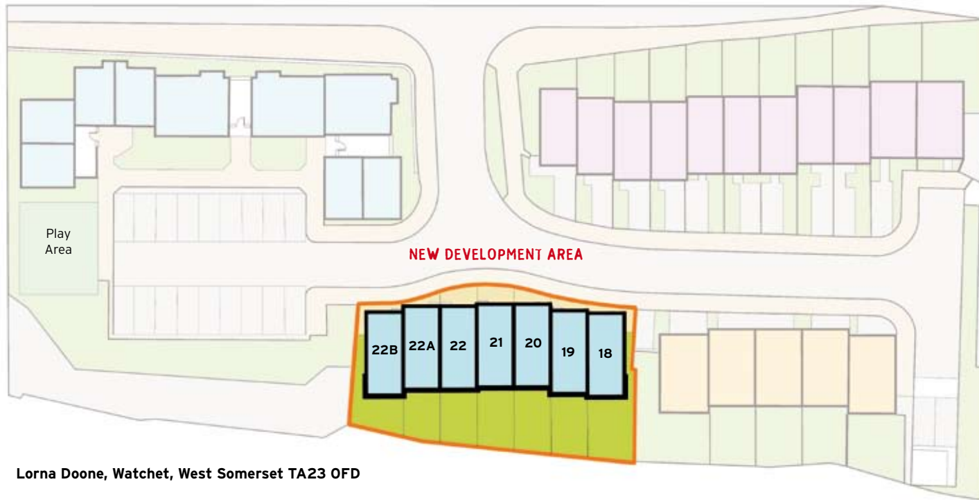
Lorna Doone, Watchet, West Somerset TA23 0FD